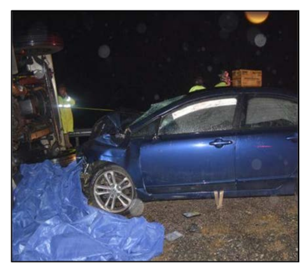
Crash scene.

The two OHP troopers were standing in a westbound lane upstream of the lane closure in an area that was partially blocked to traffic, with their backs toward oncoming traffic, assessing the scene. At that time, a motorist driving in the westbound lane partially left the roadway, went around a patrol car, and struck both troopers. One OHP trooper died on impact; the other OHP trooper was critically injured and transported to a Level 1 trauma center.