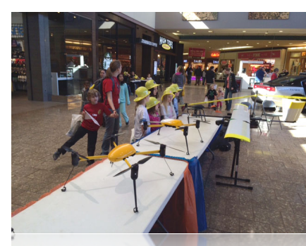
Mesa County Sheriff UAS on display at the Mesa County Safety Fair 2014

several years now we have been taking the systems to the annual "Mesa County Safety Fair". Our UAS team is on-hand to showcase the aircraft, answer questions and it provides an excellent opportunity for people to see the systems up close.