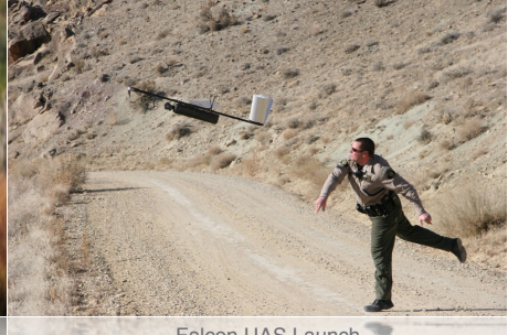
Falcon UAS Launch

Do other Law Enforcement Agencies operate UAS? Yes, but the numbers are very low. Of the 19,000 agencies in the United States, we estimate less than ten agencies are actively pursuing FAA approval and/or utilizing UAS.