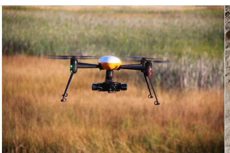
Draganflyer X4-ES UAS